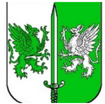
SHIRE OF CONNACHT