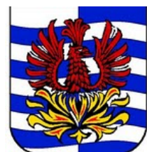
DUCHY OF CASHEL