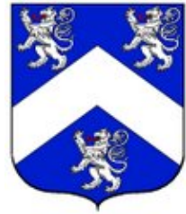
DUCHY OF SOMERSET